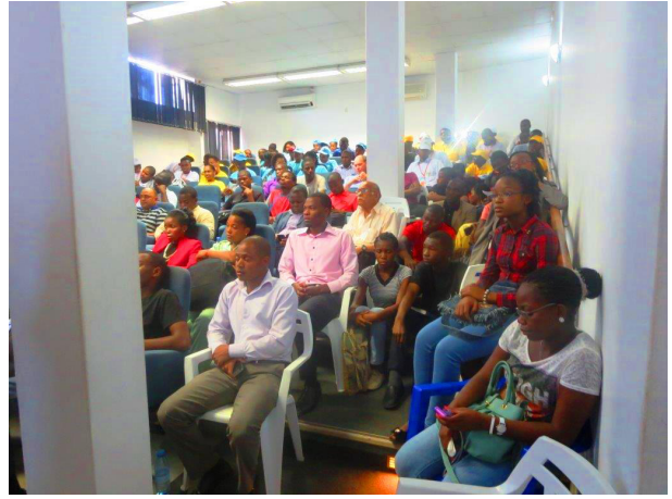
Participants listening to the presentation of the Deontological and Ethical Code.