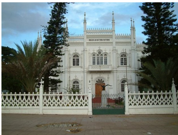
The façade of the Natural History Museum in Maputo, Mozambique